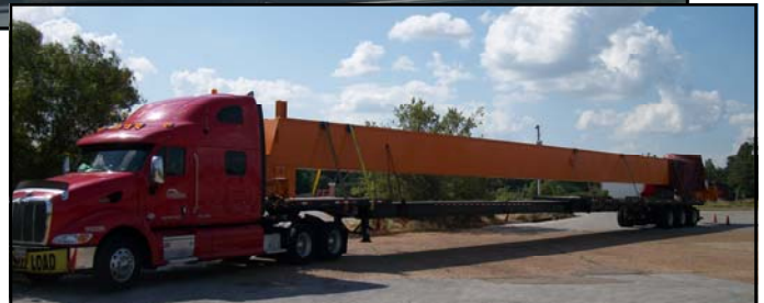
Terry Phillips (900289) hauled this load with dimensions of 120'L x 13'6" H, 100,000 pounds.