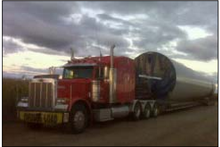
Kervin Clark (900120) hauled this wind tower section in September in Wisconsin. Kervin started driving for Lone Star in November, 2005.