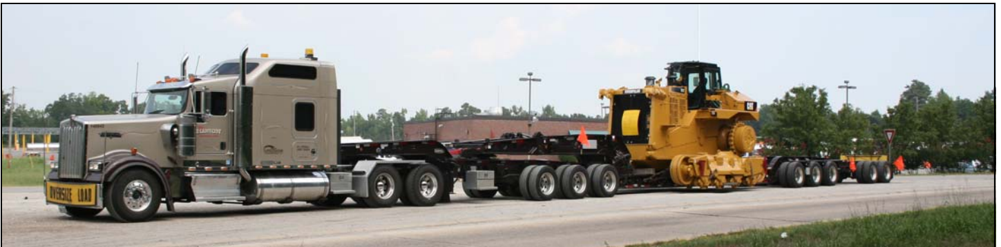
This load picked up in East Peoria, IL and delivered to a dealer in Eagle Pass, Texas. When Ken Hanson (140042) arrived, the customer had a crane on site waiting to off load. Ken looked at the crane, had the customer send it away, then proceeded to throw down 4 hardwood blocks and off loaded the machine without a crane. The customer was so pleased, he had Lone Star haul five more machines in this configuration using a beam trailer, which saved the customer about $30,000 in cranes.