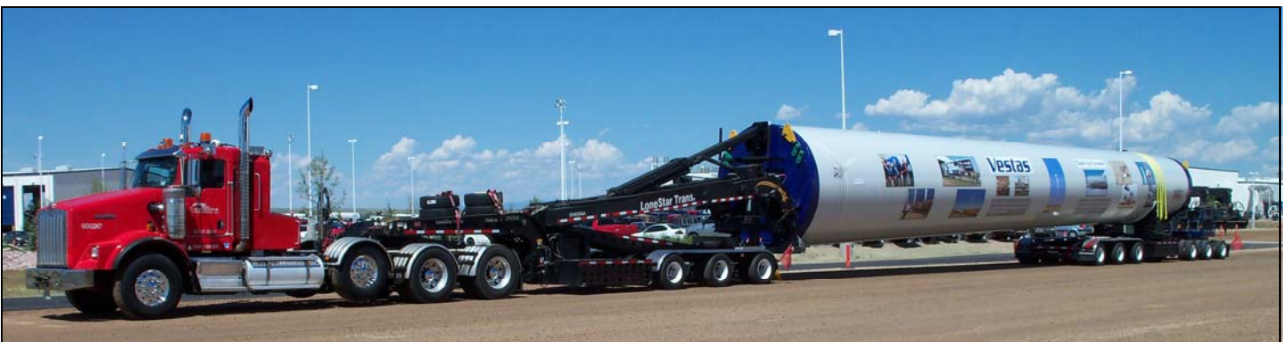
This tower section was moved in the Colorado State Fair Parade in Pueblo, Colorado for Vestas, by Howard Broussard (900247) .