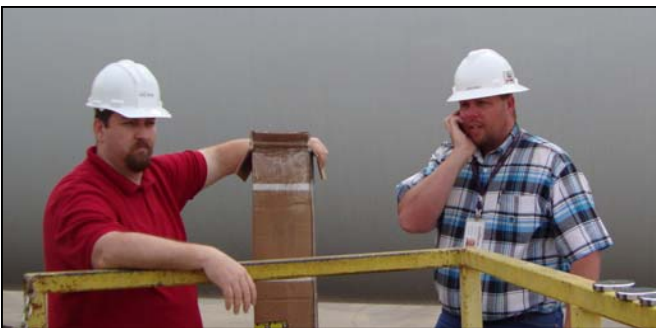
Schnabel Trailer with Wind Tower Section Displayed at Convention